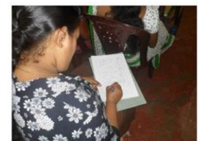
Data collection in Puttlam (December 2019)