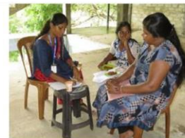
Data collection in Chavakachcheri and Karainagar (September 2019)