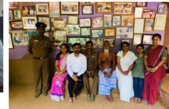
Research Team at Mahiyanganaya Adivasi (Vaddas) Community village (December 2019)